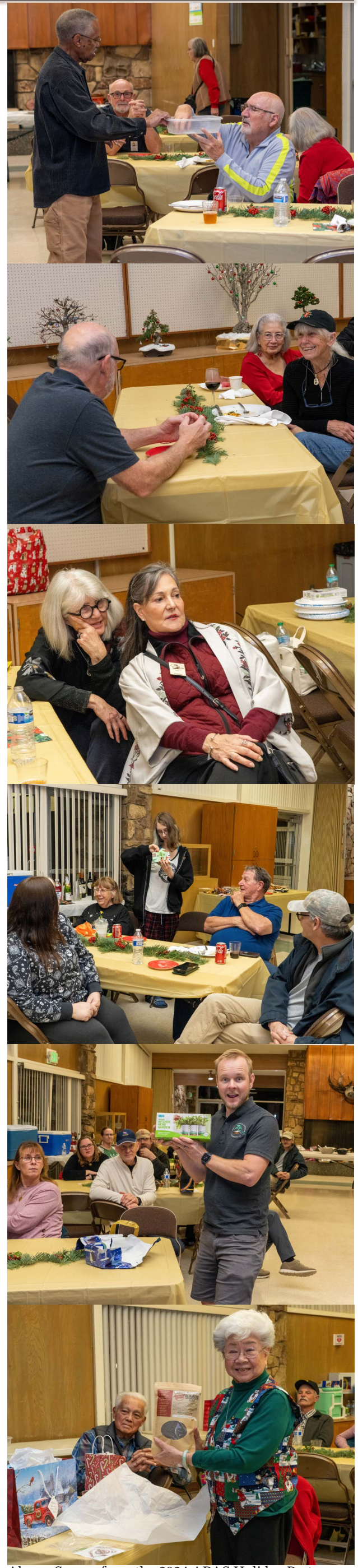
Above: Scenes from the 2024 ABAS Holiday Party