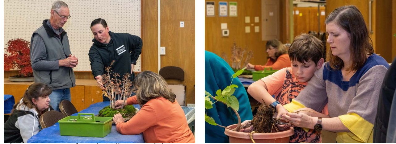
Above: More scenes from the Fall Care workshop ABAS Seasonal Bonsai Care Series

Bring your deciduous material that needs thread or root grafting (that you left whips on to use!) and if you aren't sure, bring candidates anyway for discussion. This will be a group learning opportunity. Ideal material will benefit from having a branch or root added (most trees) and will have long, pliable whips to be used for the grafts. We will have available some individual whips for root grafting on maples, but if you have any surplus root graft material, bring that too. Any members with experience doing thread or root grafts are encouraged to attend and share their wisdom at the various workstations. Thread grafting is an incredibly easy and useful technique utilized in developing deciduous bonsai. Do not miss this opportunity to participate and learn. Note this will not be on Zoom.