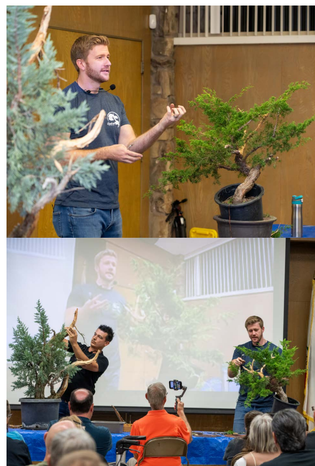
Above: Scenes from Dueling Demos