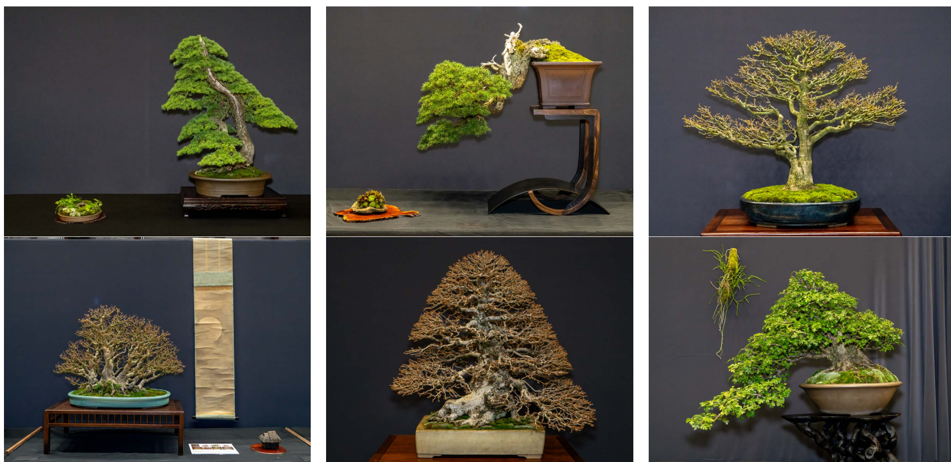
Above: But a small taste of some of the displays @ PBE