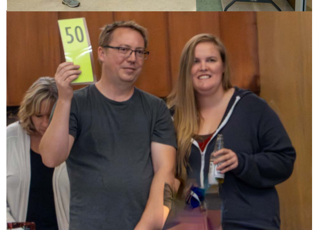
This page: Scenes from the 2024 Fall Sale and Auction