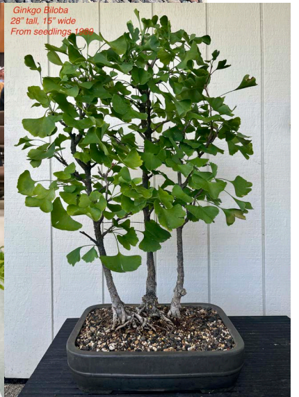
From top: a tasting of trees featured in 2024 auction cypress, hornbeam, privet, wisteria, ginkgo. Immediate left, above, right: scenes from 2023 auction.