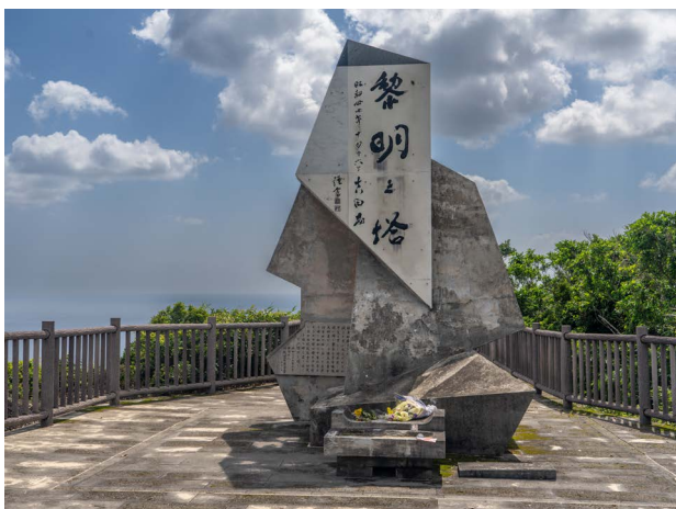
Above left: it's just a start, above right: monument at the Okinawa Peace memorial