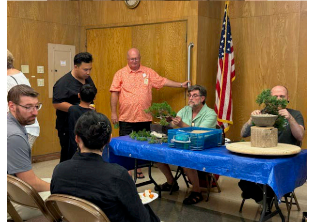
Above, right: Scenes from Summer Splash 2024