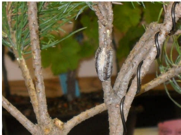
It was very healthy and even had a Praying Mantis egg case on one branch which will be cut off after it "hatches".

Below are pictures of some of the display trees.