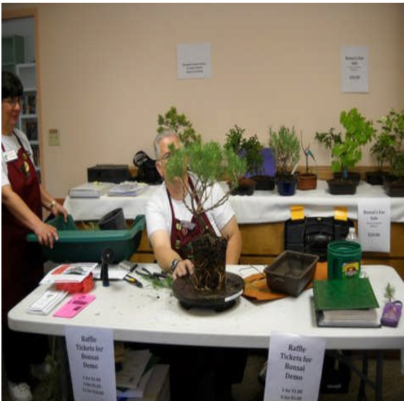
After initial pruning, the roots were checked.