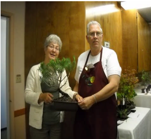
Demo tree winner!!

This was a beautiful show and I look forward to their main show on June 26 th at the Ridge Road Garden Center.