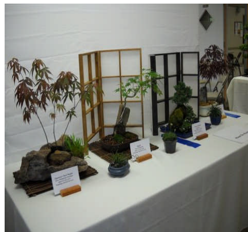
Best in Show with two ribbons.