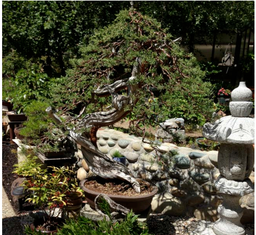
A professionally styled collected Juniper belonging to the Judd's